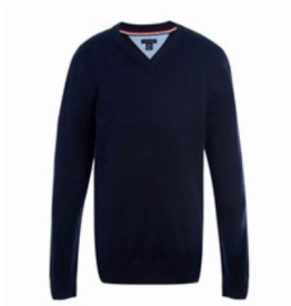
FEMININE FIT LONG SLEEVE V-NECK SWEATER