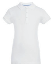
SHORT SLEEVE INTERLOCK FEM FIT POLO