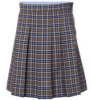
SCHOOL PLAID PLEATED SKORT