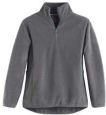
CO-ED 1/2 ZIP FLEECE JACKET