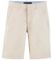
FLAT FRONT TWILL BLEND SHORT