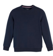
CO-ED CREW SWEATSHIRT