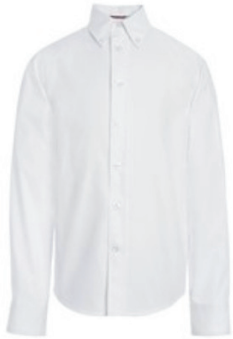
LONG SLEEVE PINPOINT OXFORD SHIRT