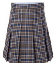
SCHOOL PLAID BOX PLEAT SKIRT