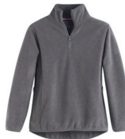
CO-ED 1/2 ZIP FLEECE JACKET