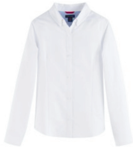
LONG SLEEVE OXFORD BUTTNDOWN BLOUSE

Polo, Pants, Skirt, Sweater Tie (purchased at school) Button down collar dress shirt