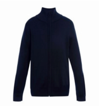
LONG SLEEVE FULL ZIP SWEATER