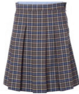
SCHOOL PLAID PLEATED SKORT