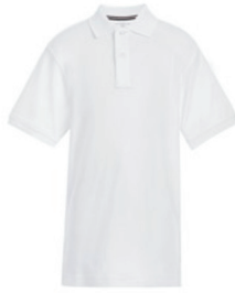
SHORT SLEEVE INTERLOCK CO-ED POLO

Required Polo, Pants, Skirt, Sweater Tie (purchased at school) Button down collar dress shirt