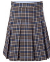
SCHOOL PLAID BOX PLEAT SKIRT