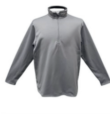
COED PERFORMANCE HALF ZIP PULLOVER